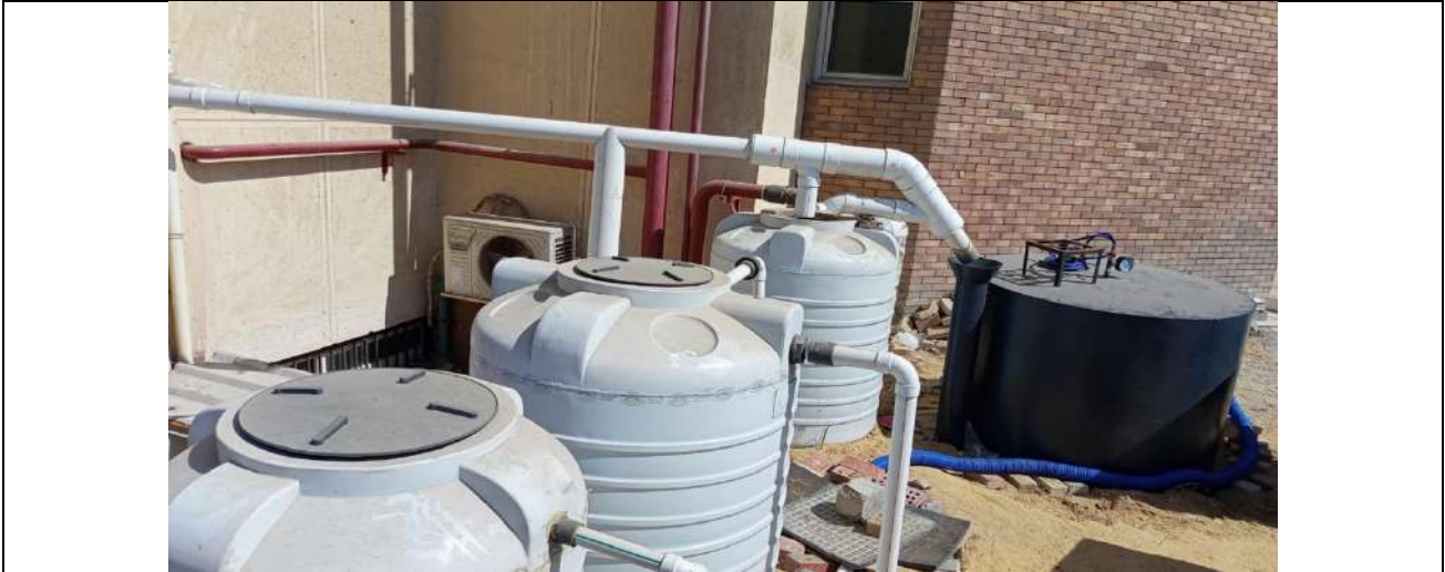
Wastewater treatment unit at the Faculty of Engineering