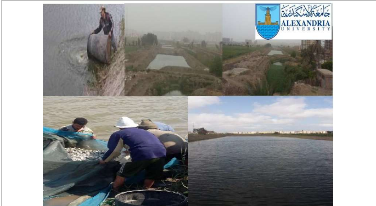
The irrigated water supplied to the fish farm at the Agriculture Experimental Research Station of the Faculty of Agriculture is recycled to irrigate the crops, vegetables, and fruits of the land farm.