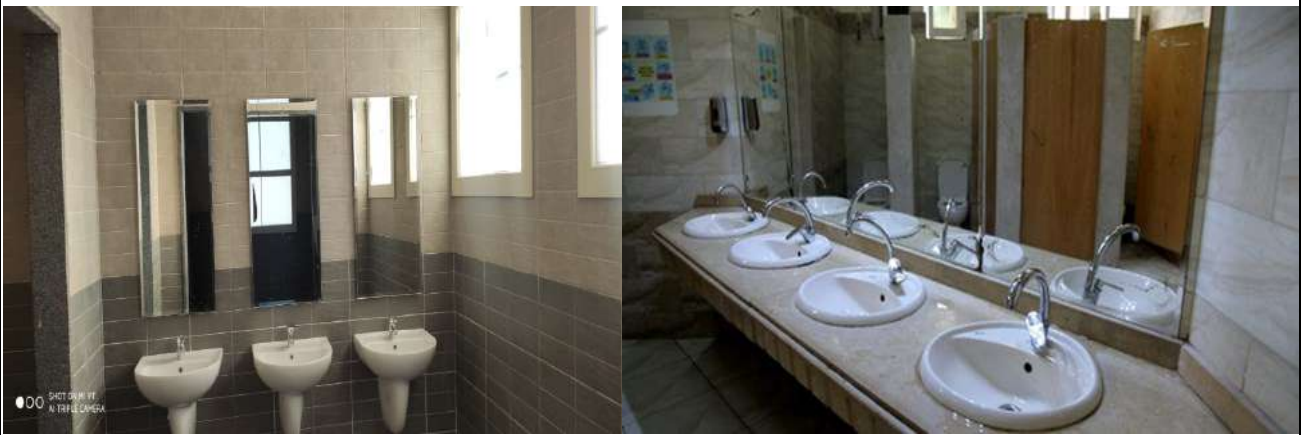
Supplying water taps with water conservation units (Alexandria University, Egypt)