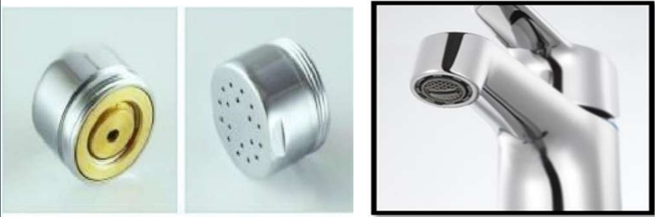
Supplying water taps with water conservation units (Alexandria University, Egypt)