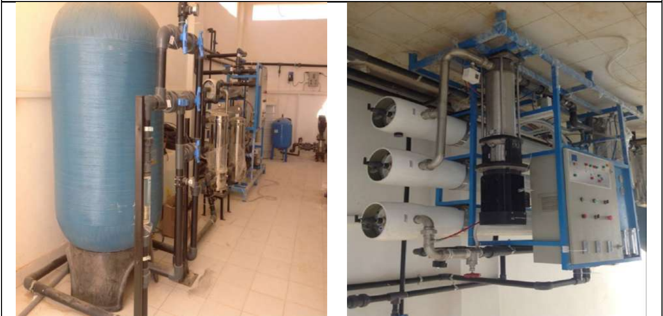
A 100 m 3 desalination unit in Wadi Natroun (Faculty of Agriculture, Alexandria University)