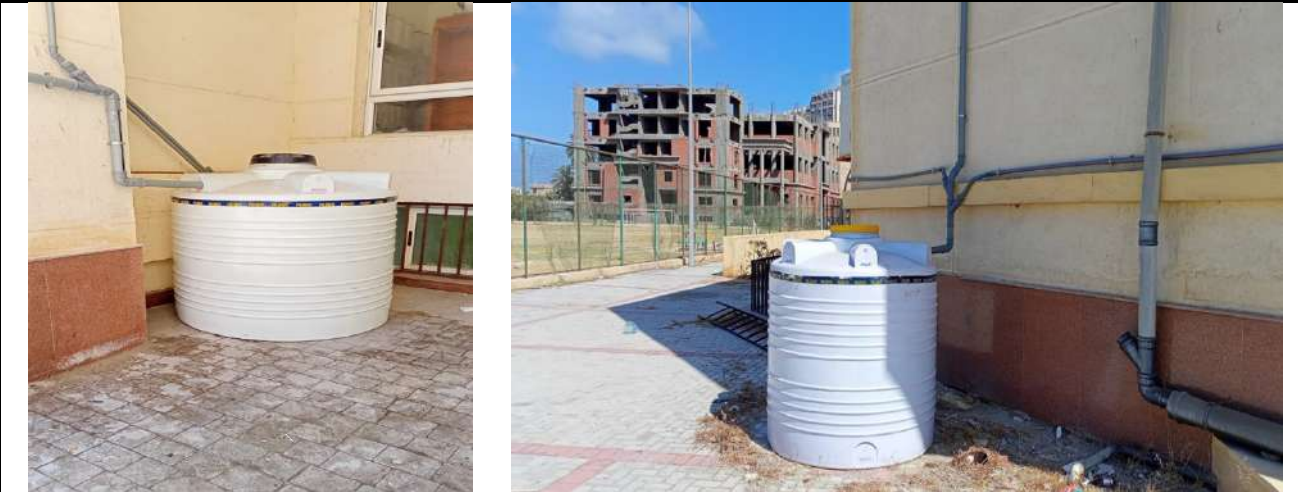
Air conditioning water collection and reuse unit - Faculty of Engineering