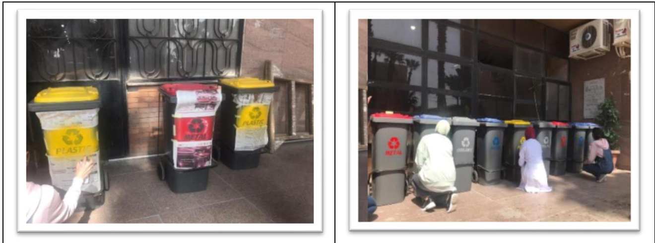
Recycling Program for University Waste (Alexandria University, Egypt)