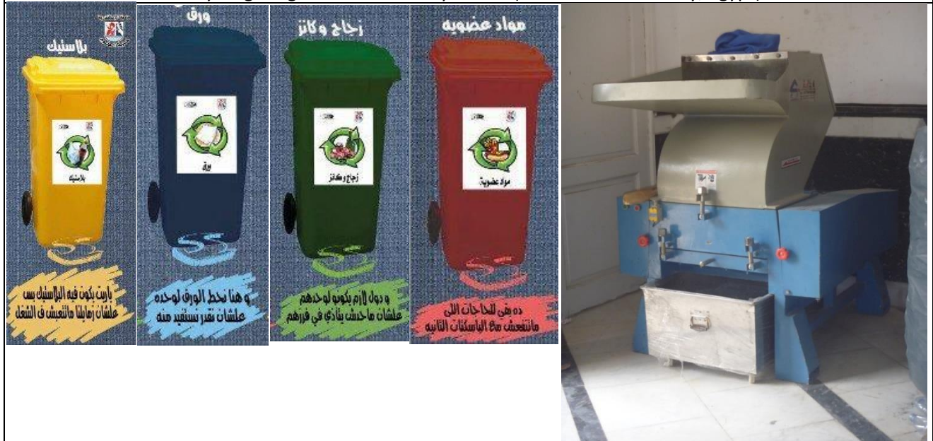
Program for separation of Paper, Plastic, aluminum cans, glass and organic waste in Campus (Alexandria University, Egypt)