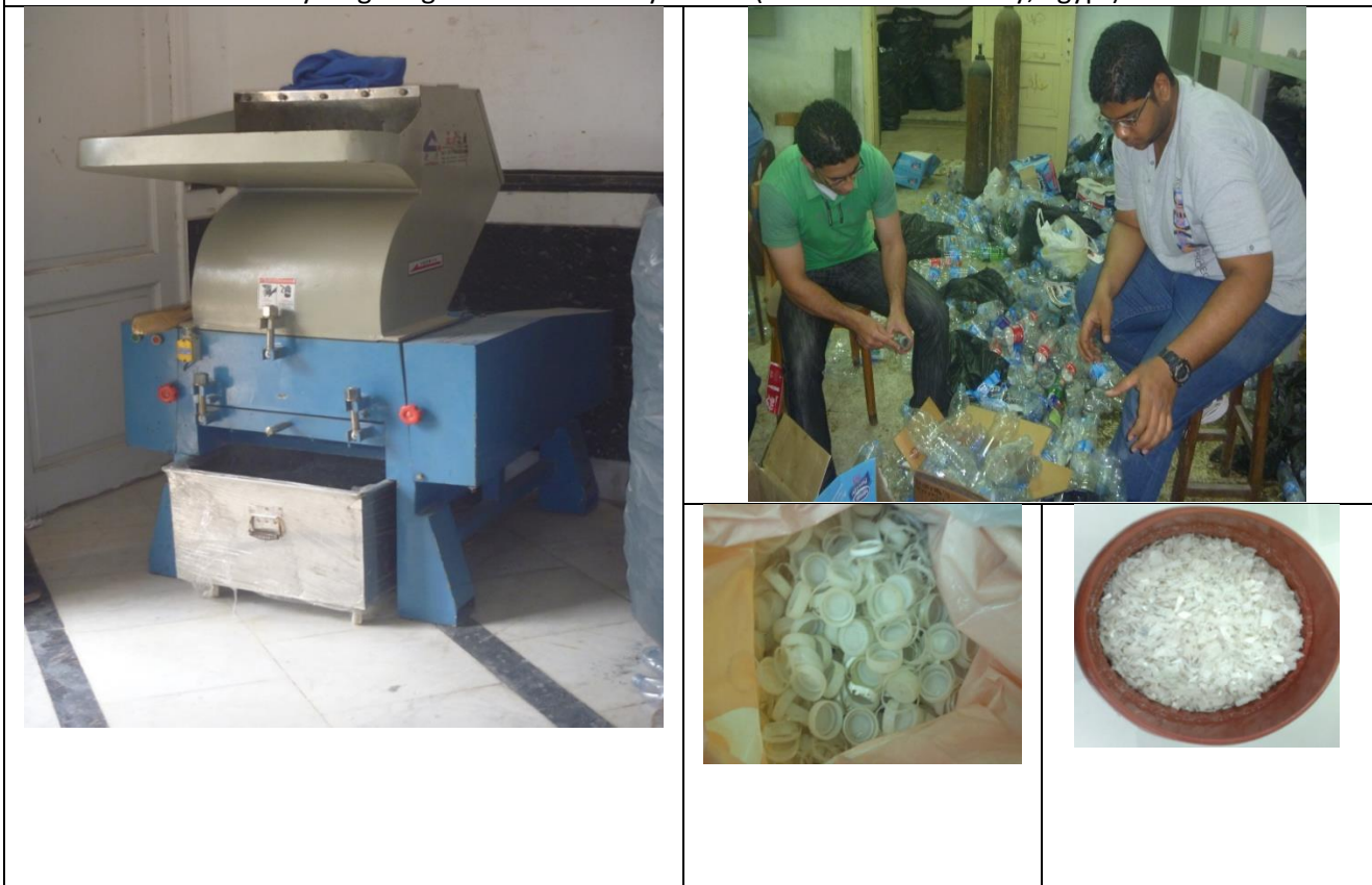
Recycling of plastic waste at the Faculty of Science (Alexandria University, Egypt)