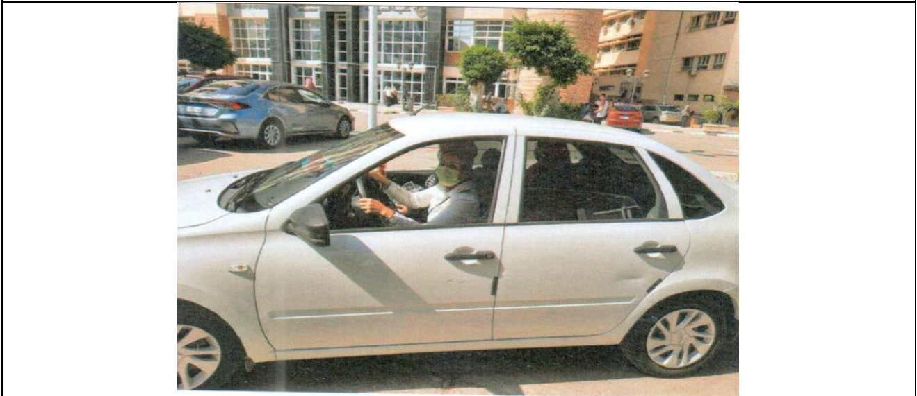
Ride Share (Carpool) (Faculty of Pharmacy, Alexandria University, Egypt)