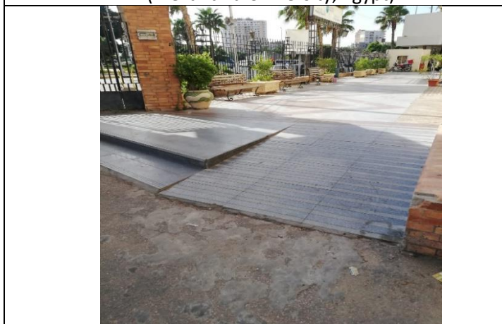
Replacing steps with ramps for disabled people (Faculty of Pharmacy - Alexandria University)