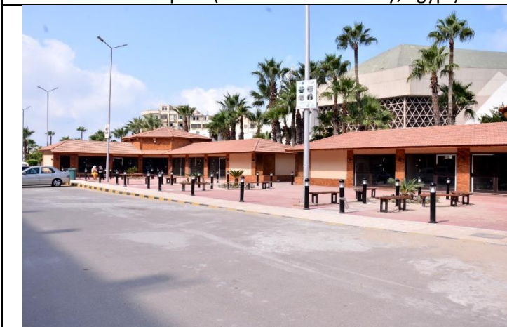
Pedestrian path and street lamp for pedestrian in night (Alexandria University, Egypt)