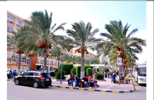
Pedestrian path and street lamp for pedestrian in night (Alexandria University, Egypt)