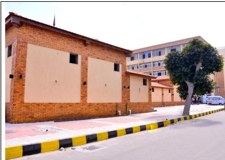
Pedestrian path (Alexandria University, Egypt)