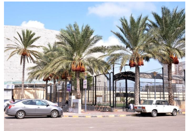
Pedestrian path (Alexandria University, Egypt)