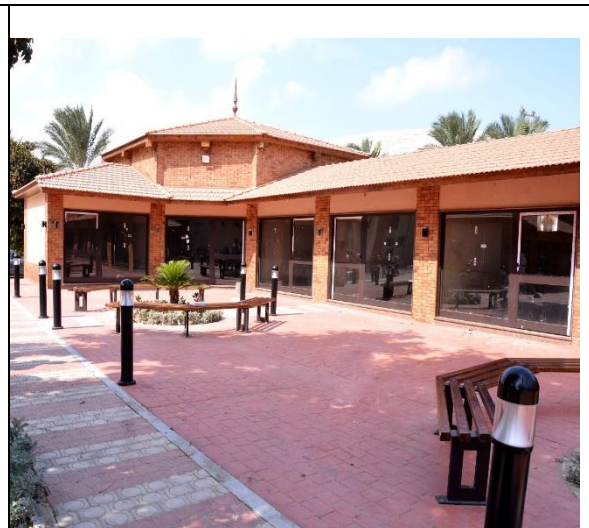
Pedestrian path (Alexandria University, Egypt)