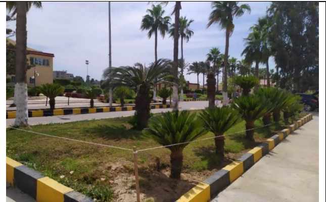
Pedestrian path (Alexandria University, Egypt)