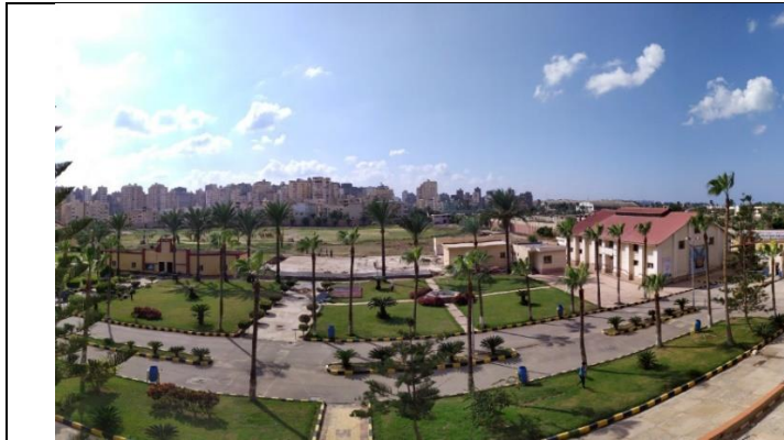
Pedestrian path (Alexandria University, Egypt)