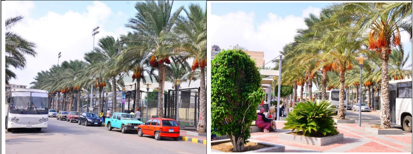
Shuttle Services (Alexandria University)