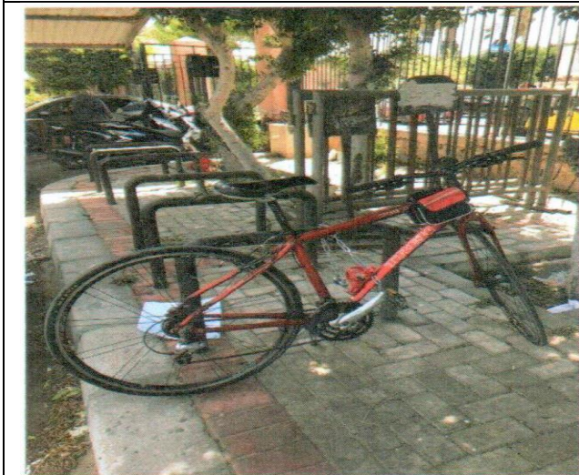
Campus Bikes parking at the Faculty of Engineering (Alexandria University, Egypt)