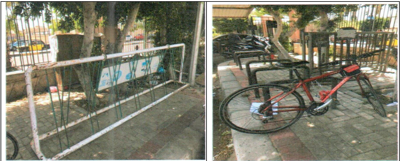
Campus Bikes parking at the Faculty of Engineering (Alexandria University, Egypt)

[5.14] Program to limit or decrease the parking area on campus for the last 3 years (from 2019 to 2021)