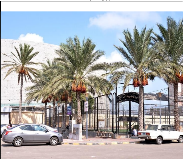
Campus of Humanities and Social Sciences (Alexandria University, Egypt)