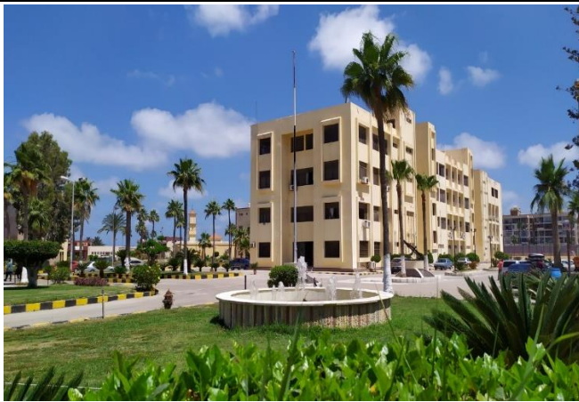
Faculty of Physical Education for Boys (Alexandria University, Egypt)