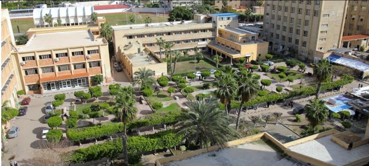
Faculty of Science (Alexandria University, Egypt)