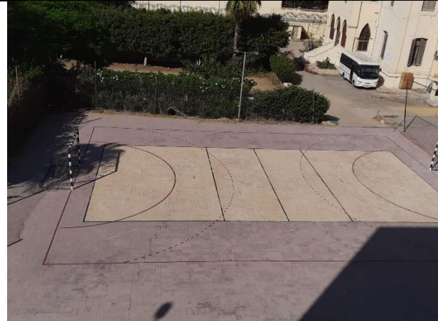
Saba Basha Babis tenth farm (Alexandria University, Egypt)