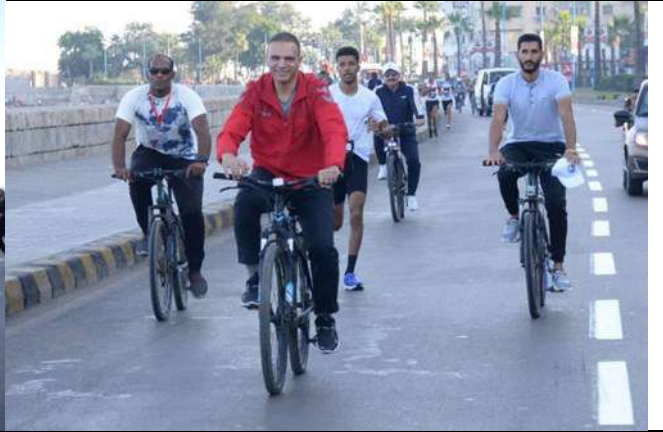
The cycling race and marathon activities launched within the activities of the Global Conference on Climate Change and Sports, organized by the Faculty of Science and Faculty of Physical Education in Abu Qir in the period from October 27-29, 2022