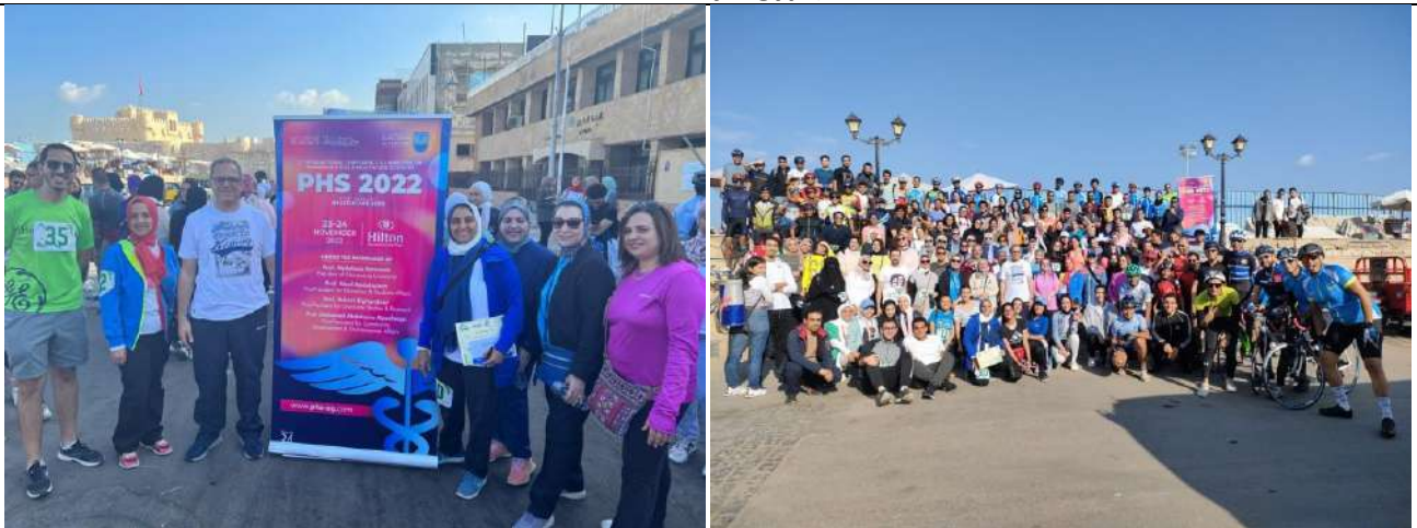
The Faculty of Pharmacy organized a sports marathon for walking and cycling titled "Running for Green" in collaboration with ASPSA "Alexandria Scientific Pharmaceutical Students Association". This event is part of the preparations by both the Faculty of Pharmacy and Alexandria University for the COP27 Climate Change Conference.