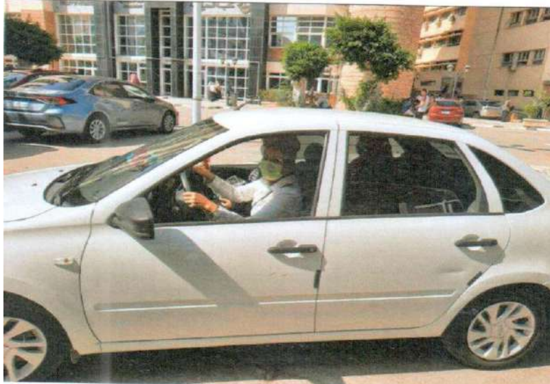
Ride Share (Carpool) (Faculty of Pharmacy, Alexandria University, Egypt)