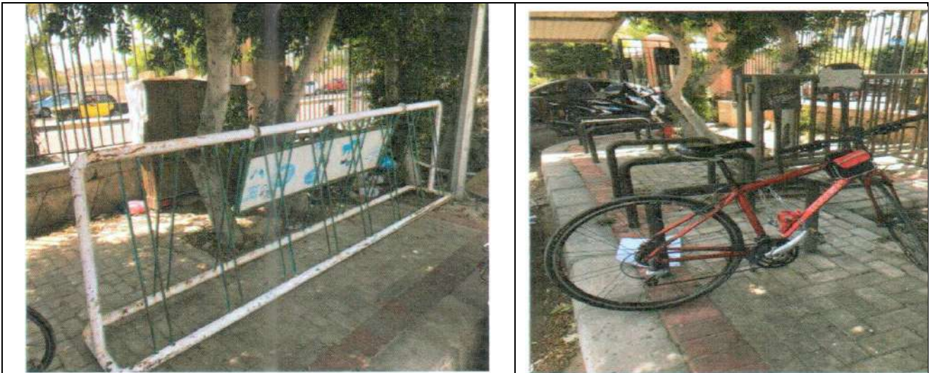
Campus Bikes parking at the Faculty of Engineering (Alexandria University, Egypt)