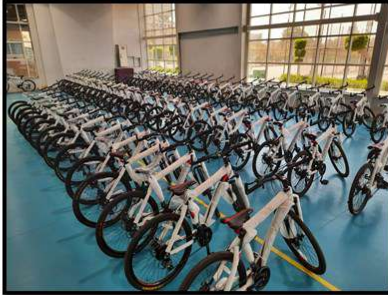
The Alexandria University council bicycle initiative to provide a bicycle for each student