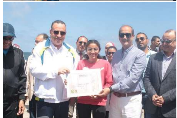
Faculty of Sport Education Abo Qir Hosts Environmental Awareness Marathon entitled "Our Health is in Our Planet" in collaboration with the Ministry of Environment and Sanofi on May 4, 2024. The marathon began in front of Stanley Bridge and concluded at the University Administration Building in Shatby.