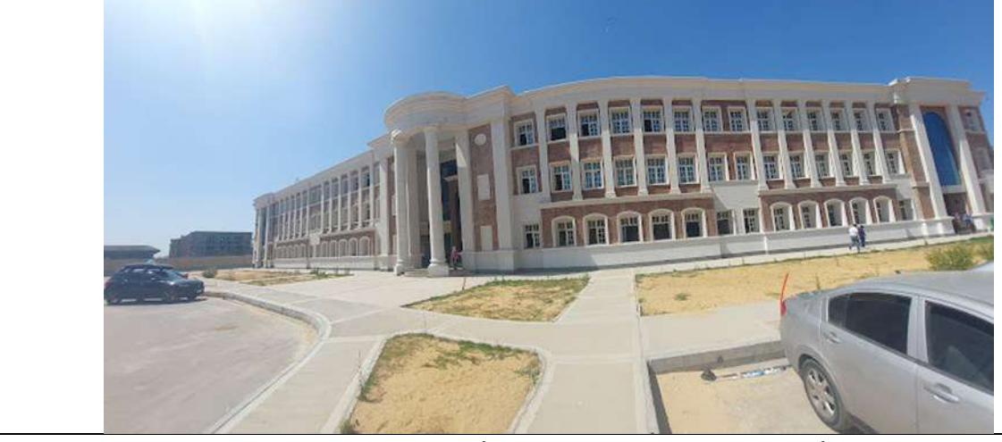
Pedestrian path (Alexandria National University)

Replacing steps with ramps for disabled people (Medical Research Institute, Alexandria University)