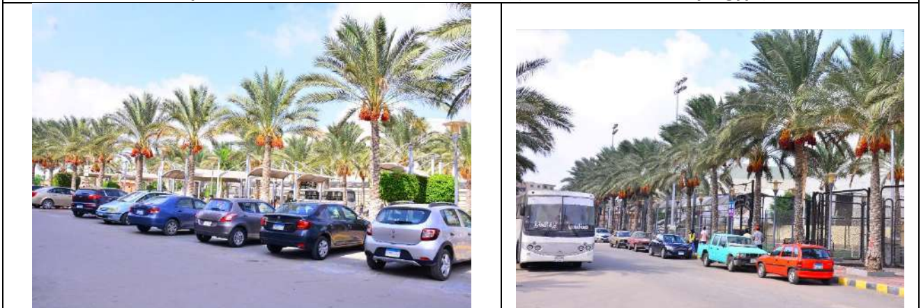
Campus of Humanities and Social Sciences (Alexandria University, Egypt)