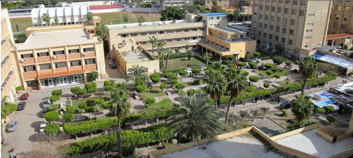
Faculty of Science (Alexandria University, Egypt)