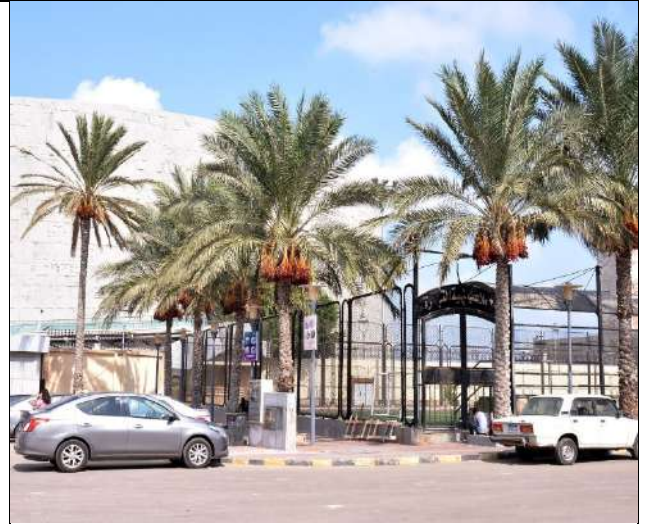
Campus of Humanities and Social Sciences (Alexandria University, Egypt)