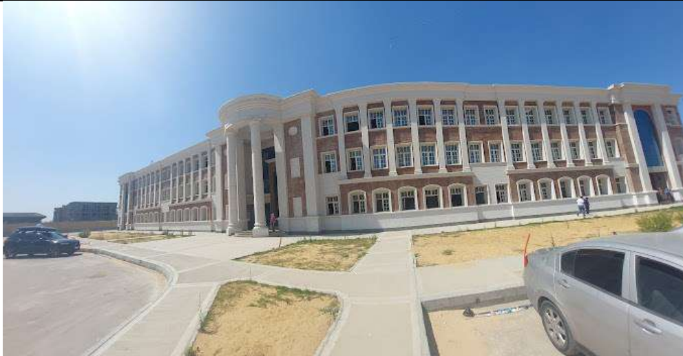
Alexandria National University