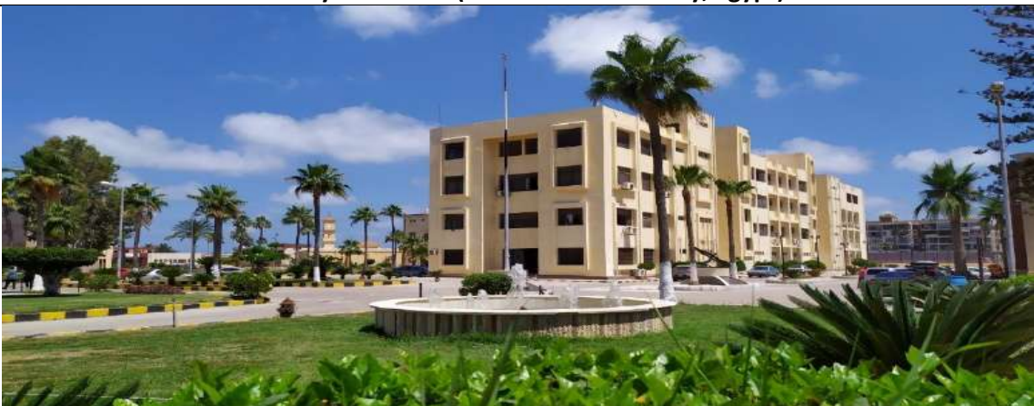
Faculty of Physical Education for Boys (Alexandria University, Egypt)