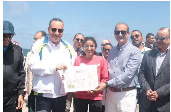
Faculty of Sport Education Abo Qir Hosts Environmental Awareness Marathon entitled "Our Health is in Our Planet" in collaboration with the Ministry of Environment and Sanofi on May 4, 2024. The marathon began in front of Stanley Bridge and concluded at the University Administration Building in Shatby.