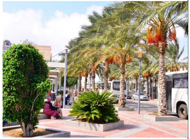
Shuttle Services (Alexandria University)