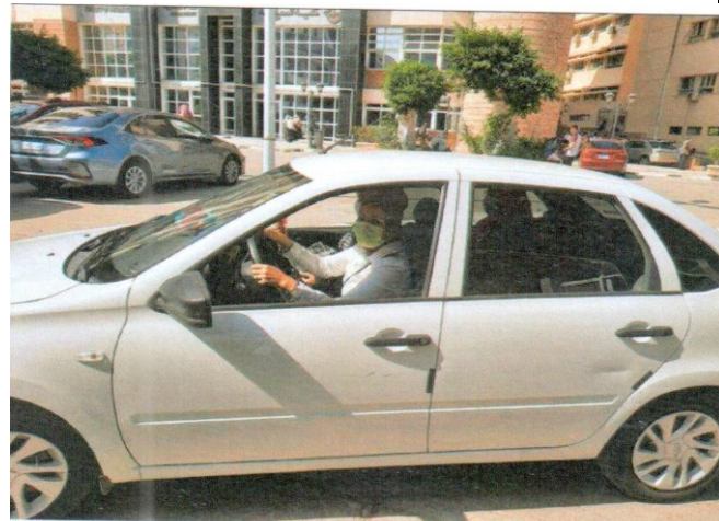
Ride Share (Carpool) (Faculty of Pharmacy, Alexandria University, Egypt)