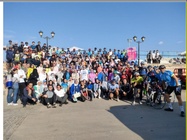
The Faculty of Pharmacy organized a sports marathon for walking and cycling titled "Running for Green" in collaboration with ASPSA "Alexandria Scientific Pharmaceutical Students Association". This event is part of the preparations by both the Faculty of Pharmacy and Alexandria University for the COP27 Climate Change Conference.