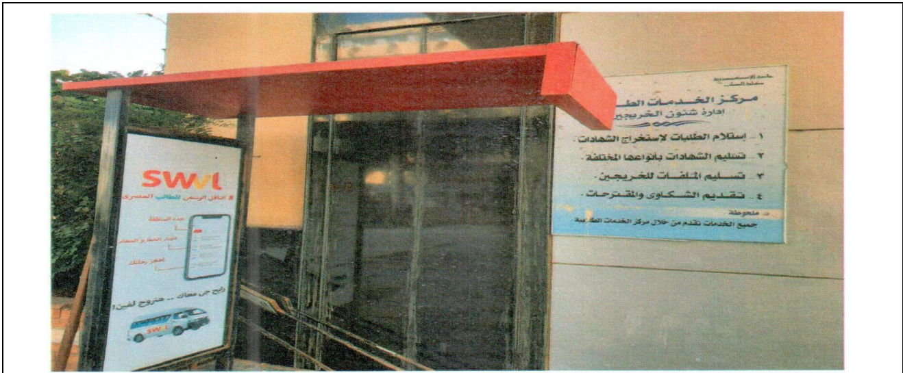
Alexandria University Shuttle Service Station