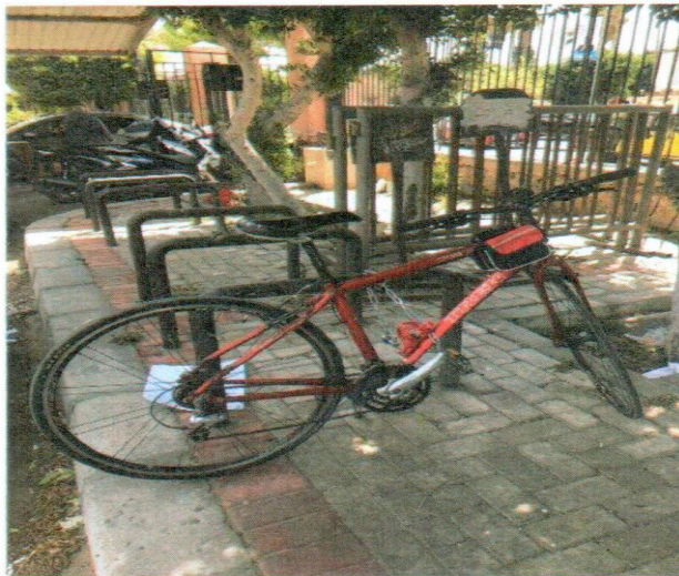
Campus Bikes parking at the Faculty of Engineering (Alexandria University, Egypt)