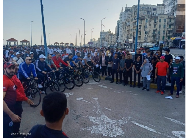
The cycling race and marathon activities launched within the activities of the Global Conference on Climate Change and Sports, organized by the Faculty of Science and Faculty of Physical Education in Abu Qir in the period from October 27-29, 2022