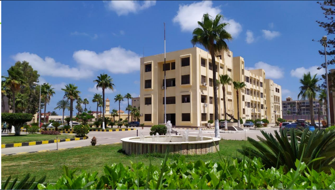
Faculty of Physical Education for Boys (University of Alexandria, EG)