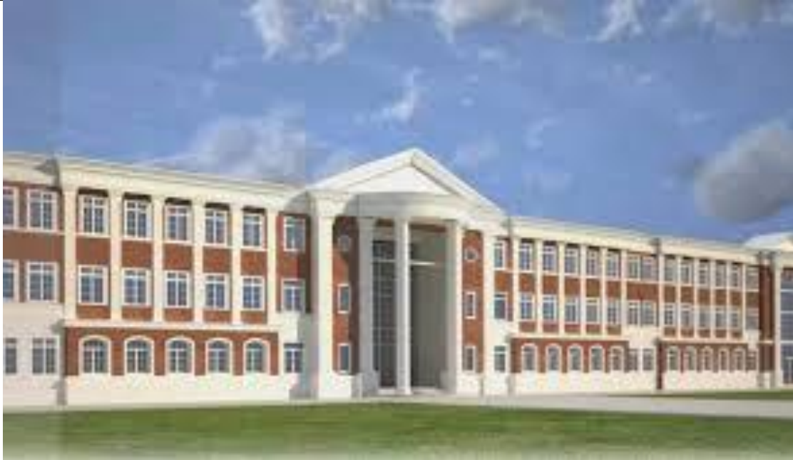
Faculty of Specific Education (University of Alexandria, EG)