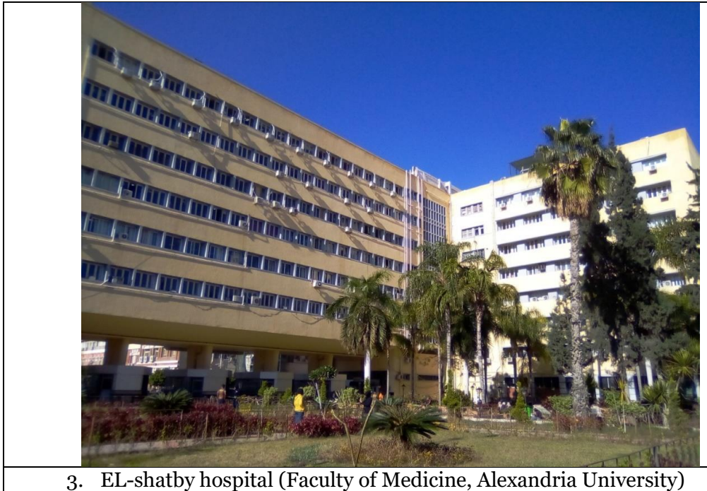
3. EL-shatby hospital (Faculty of Medicine, Alexandria University)