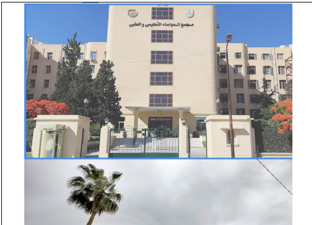
1. El-Mosaat hospital (Faculty of Medicine, Alexandria University)