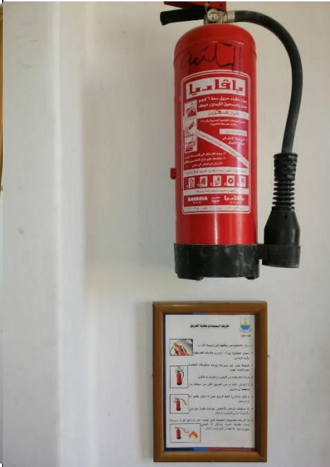
6. Fire extinguisher and description of how to use it properly (Alexandria University)