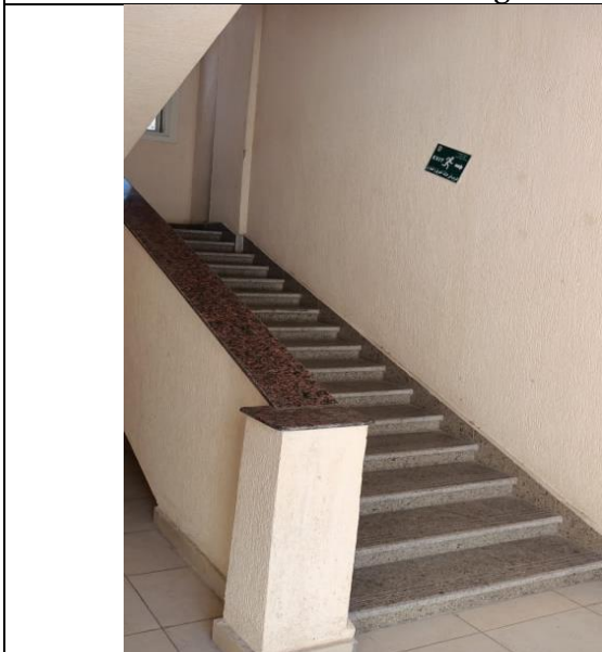
2. Fire Exit (Alexandria University)