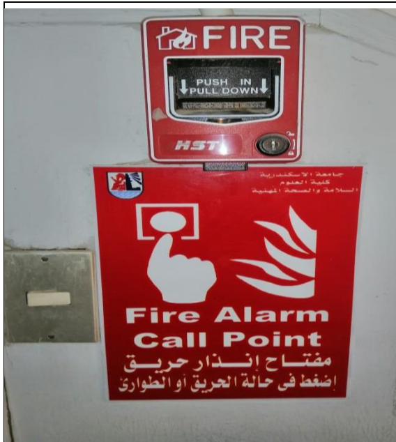
4. Fire alarm call point