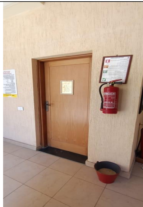
1. Fire extinguisher and sand buckets (Alexandria University)