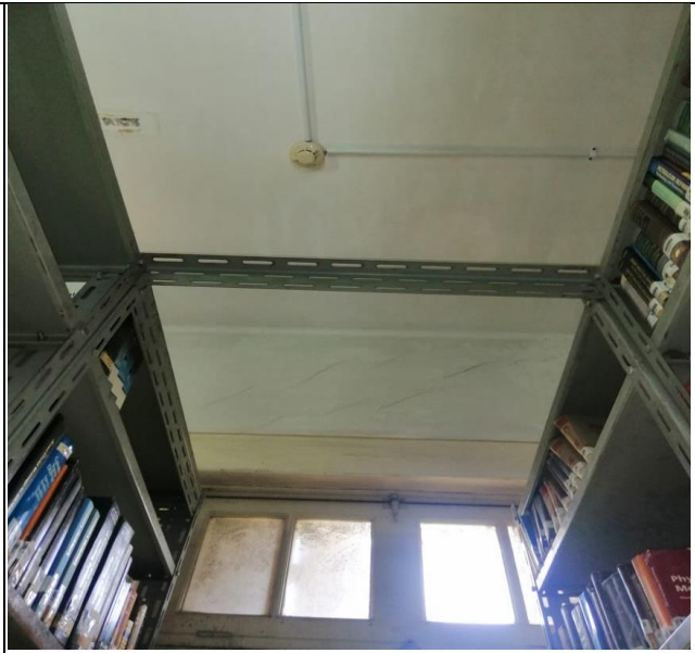
5. Fire Alarm (smoke detector)