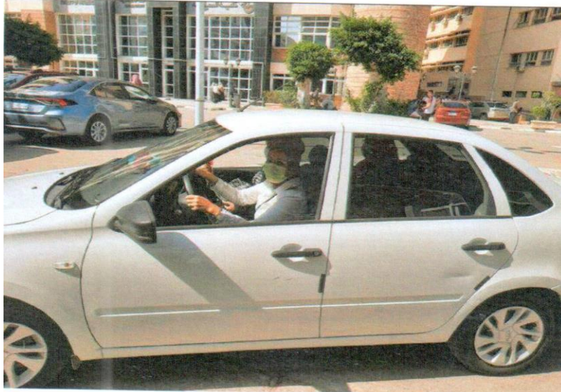
Ride Share (Carpool) (Faculty of Pharmacy, Alexandria University, Egypt)