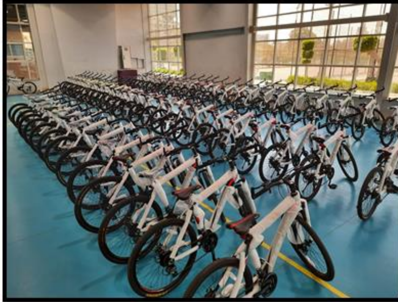
The Alexandria University council bicycle initiative to provide a bicycle for each student