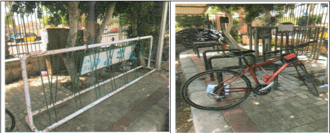
Campus Bikes parking at the Faculty of Engineering (Alexandria University, Egypt)