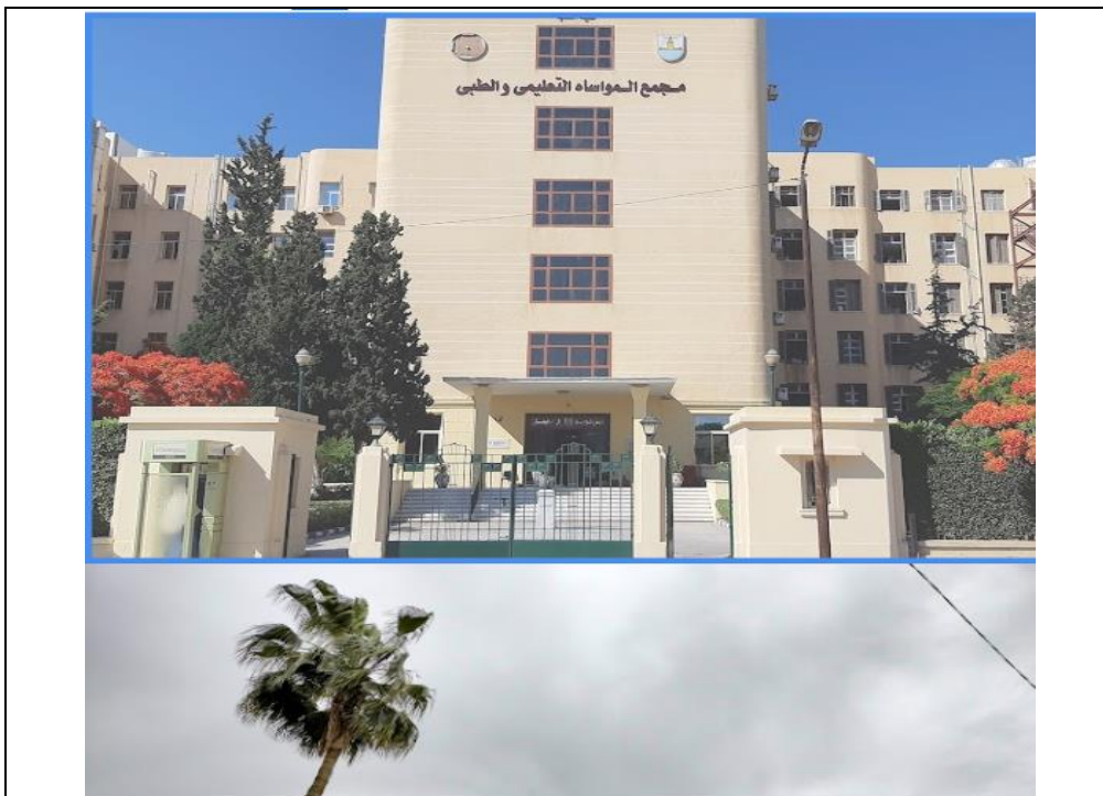
1. El-Mosaat hospital (Faculty of Medicine, Alexandria University)