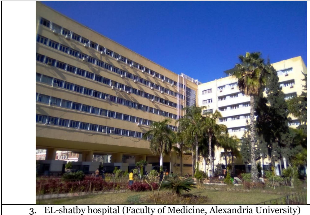
3. EL-shatby hospital (Faculty of Medicine, Alexandria University)