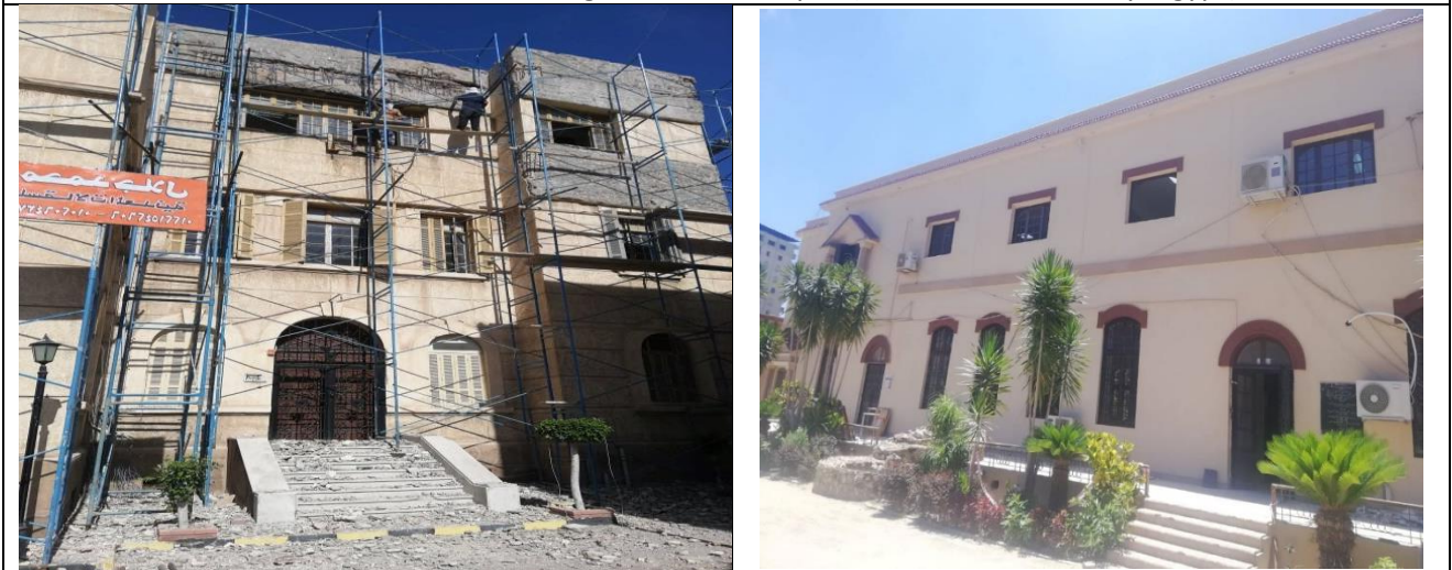
Maintenance of the Library Building