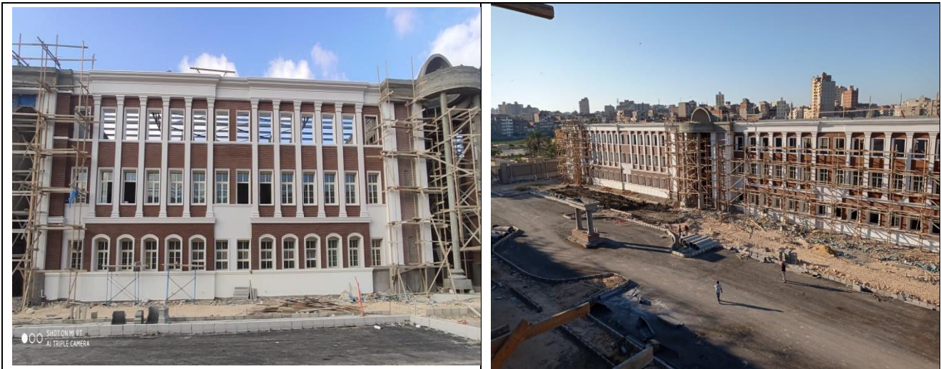
Construction of New Buildings in Abbas Campus (Alexandria University, Egypt)