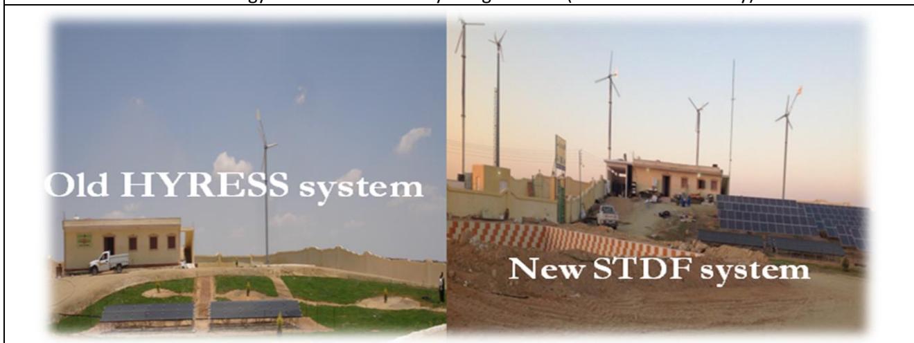
Windmill and Solar Panels (Solar Energy Center at the Faculty of Agriculture - Alexandria University)