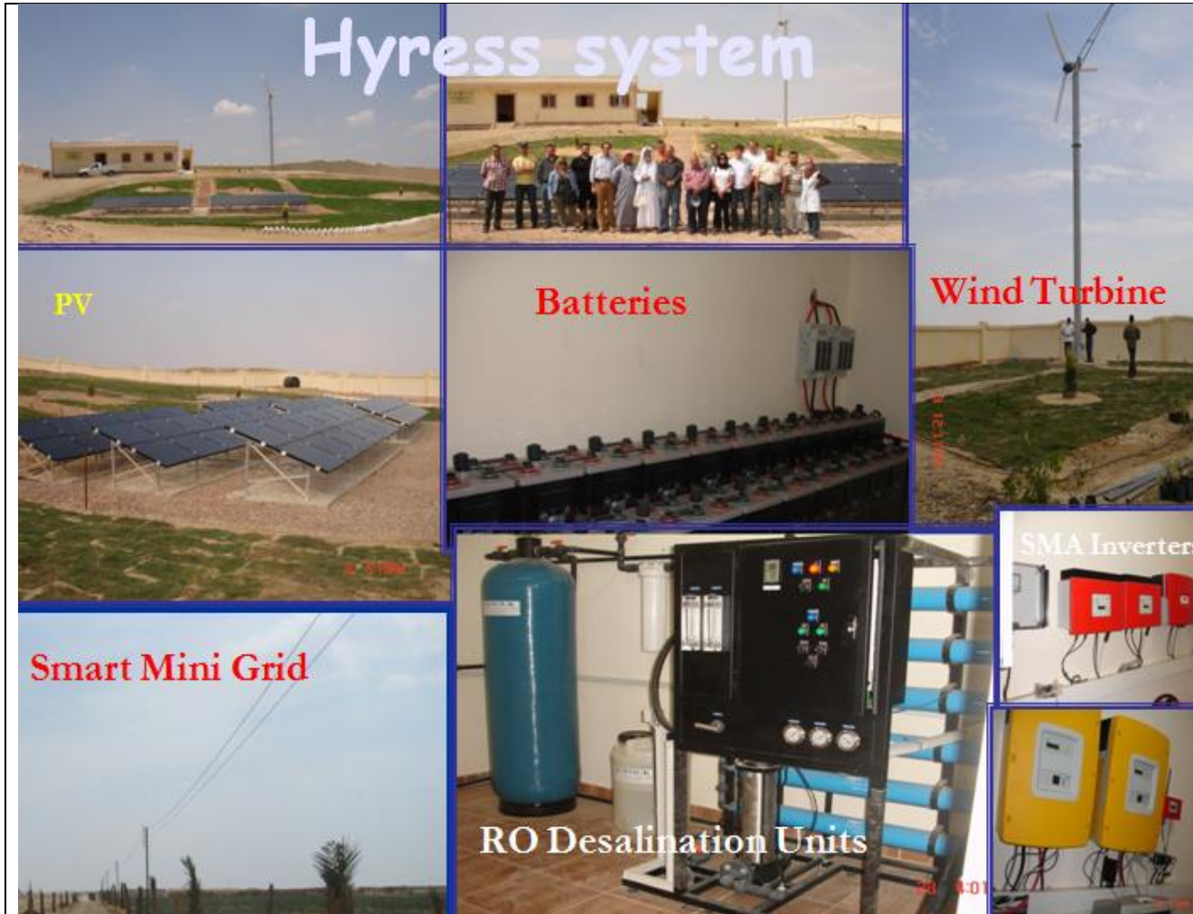
Solar Energy Center at the Faculty of Agriculture (Alexandria University)