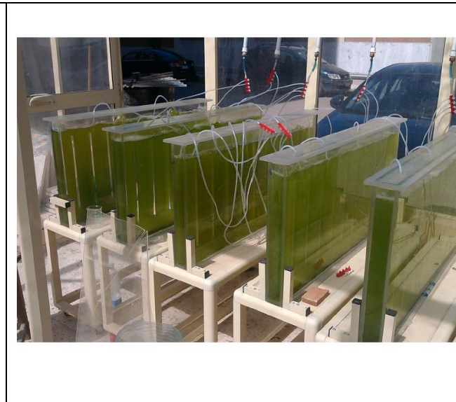
Production of Bio-Diesel from Algae in Selected Mediterranean Countries: Med-Algae Project (Faculty of Science, Alexandria University)