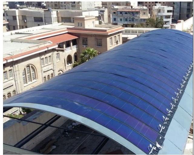
BIPV Roof Pergola, Faculty of Science in Moharram Bek (Alexandria University)