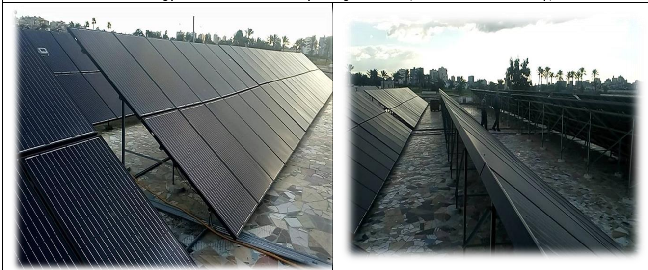
Solar Energy Center at the Faculty of Agriculture (Alexandria University)