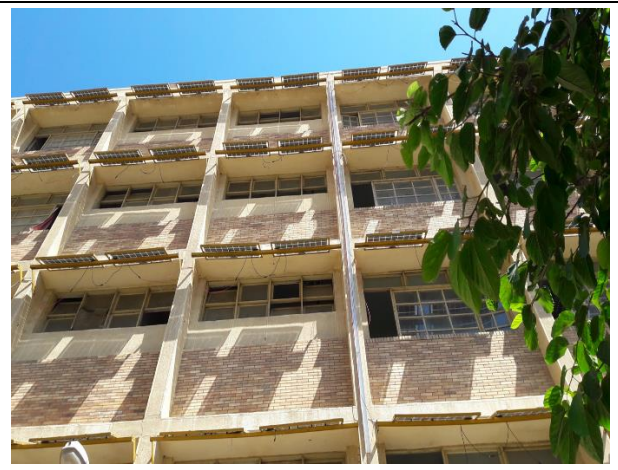
BIPV Façade Brise-Soleil System Solar Energy Project at the Faculty of Science (Alexandria University)