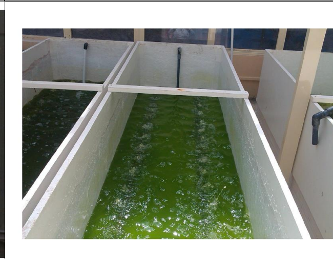
Seawater tank outside the chamber, Med-Algae Project (Faculty of Science, Alexandria University)