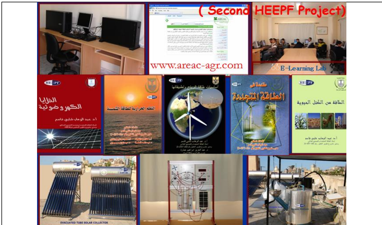
Solar Energy Center at the Faculty of Agriculture (Alexandria University)

[2] Energy and Climate Change (EC) [2.5] Renewable Energy Sources in Campus