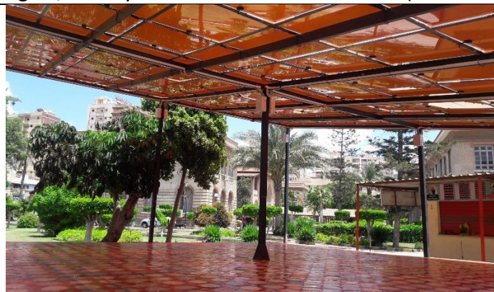
BIPV Garden Pergola, Faculty of Science in Moharram Bek (Alexandria University)