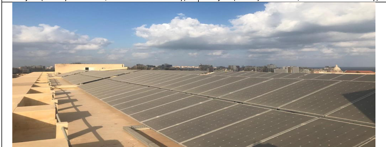
Solar photovoltaic with a capacity of 220 kilowatts on the 2000 m 2 roof top of the building of the Mechanical Engineering Department at the Faculty of Engineering