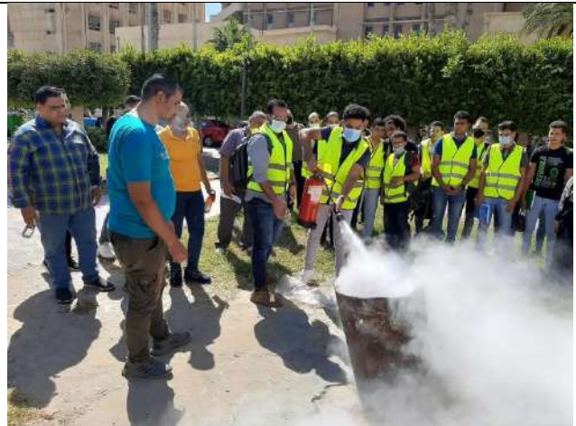
Training of the Safety and Health Student Team at the Faculty of Science