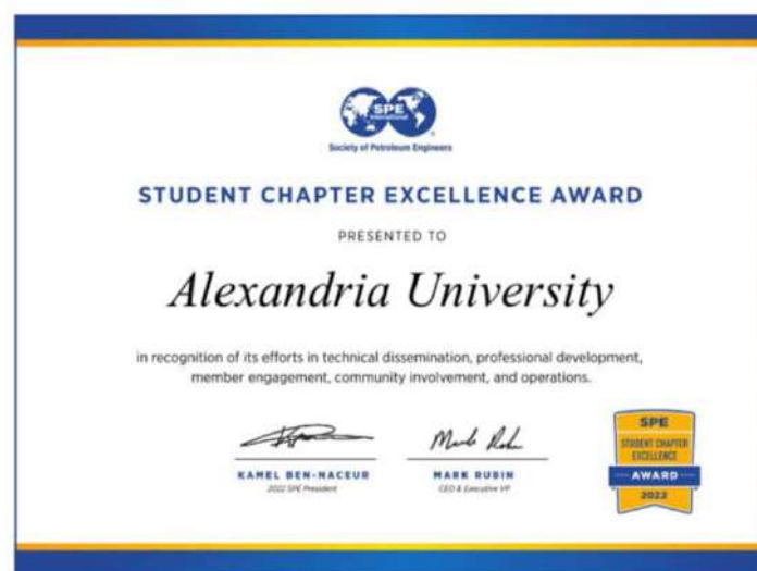
Alexandria University, received the Excellence Award from the Society of Petroleum Engineers International "Student chapter Excellence Award 2022"