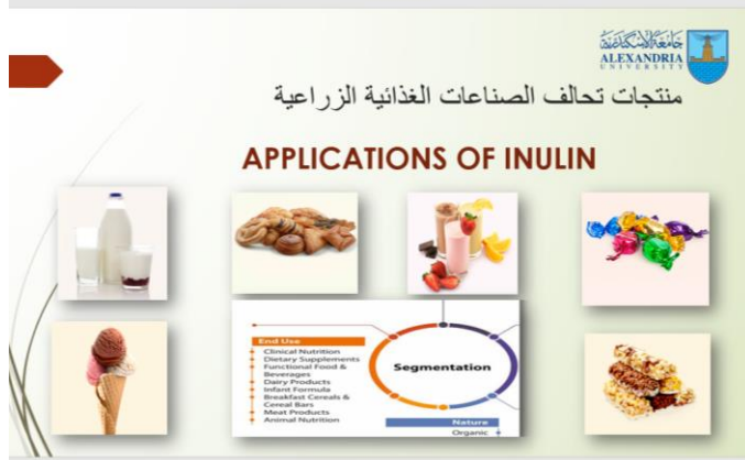
Agro-Food Industries Alliance Products