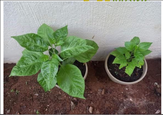
Samdha Company: The plants in the 2 photos on the left are planted in presence of natural organic fertilizers