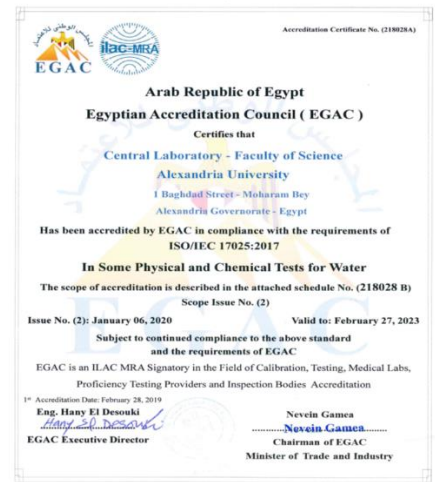
Accreditation Certificate of Central Laboratory – Faculty of Science (Alexandria University)