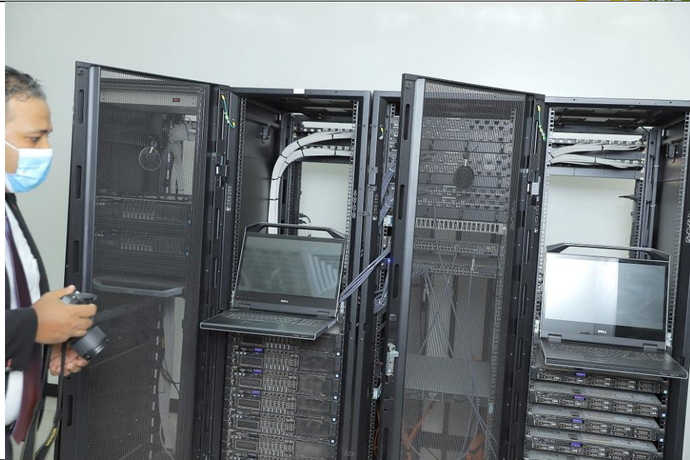
Alexandria University Technology Incubator for Smart Systems (AUTISS) Incubator (Faculty of Engineering, Alexandria University)